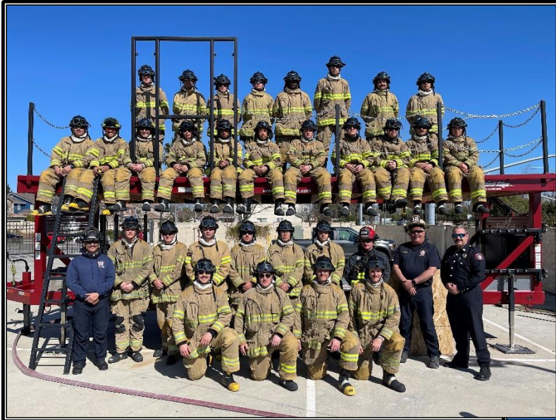
Solano Fire Academy Class 101

The Mariani Nut Co. recently constructed and donated two steel window props for the Winters Fire Department and Solano Community College Fire Academy. These props are being used to teach firefighters how to make entry through elevated stories, search and rescue, and to teach firefighters how to bail out from burning buildings during emergency situations. A big thank you to the Mariani Co. and their team for supporting us!